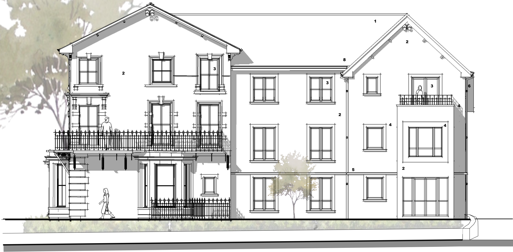
FRONT ELEVATION - Llandaff Road