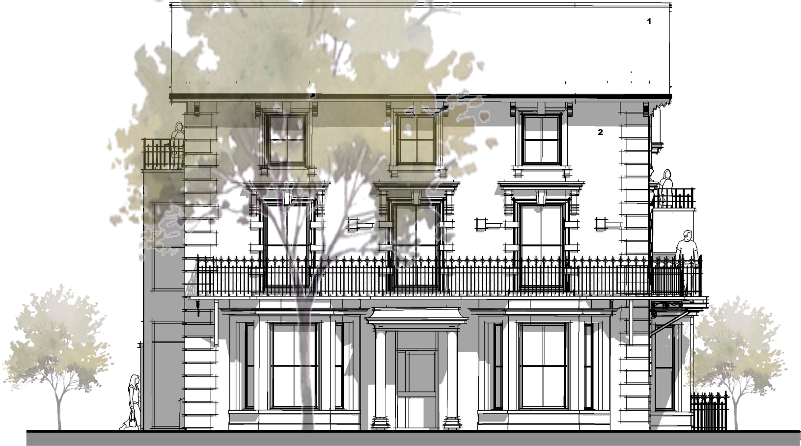
FRONT ELEVATION - Romily Road